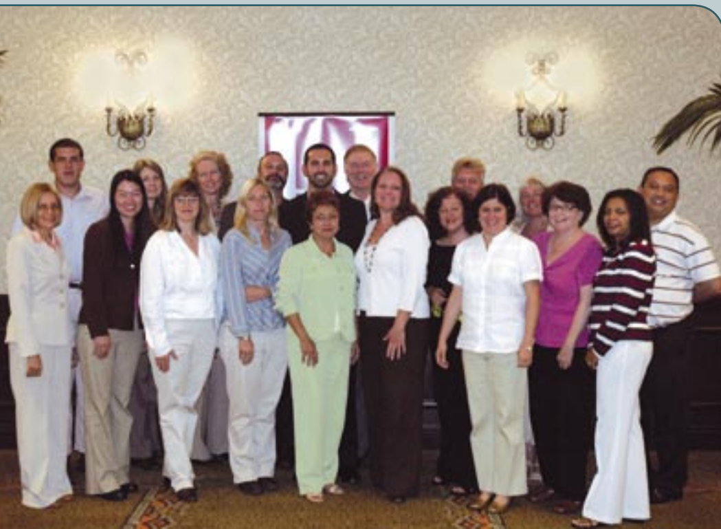
2008 HACU-DHHS program participants

The NCMHD and OMH are particularly interested in increasing participation of minority institutions and their faculty in research grant efforts that focus on the following: improving the health of minority populations, disease prevention and health promotion activities.