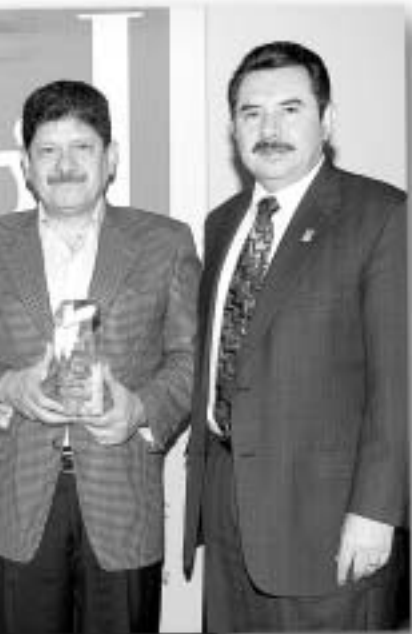
At the International Plenary.