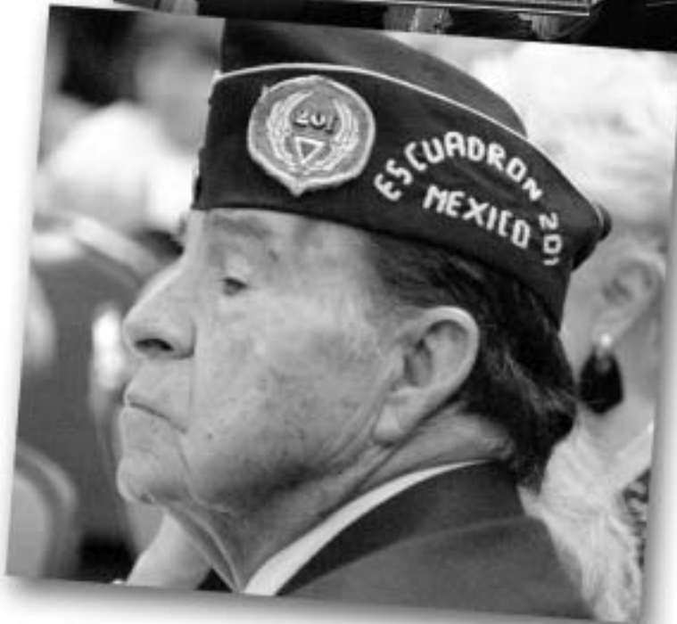
Military veterans join HACU for pre-conference celebration of Hispanic military heroes.