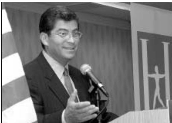
U.S. Congressman Navier Bercerra of California at the Opening Plenary.