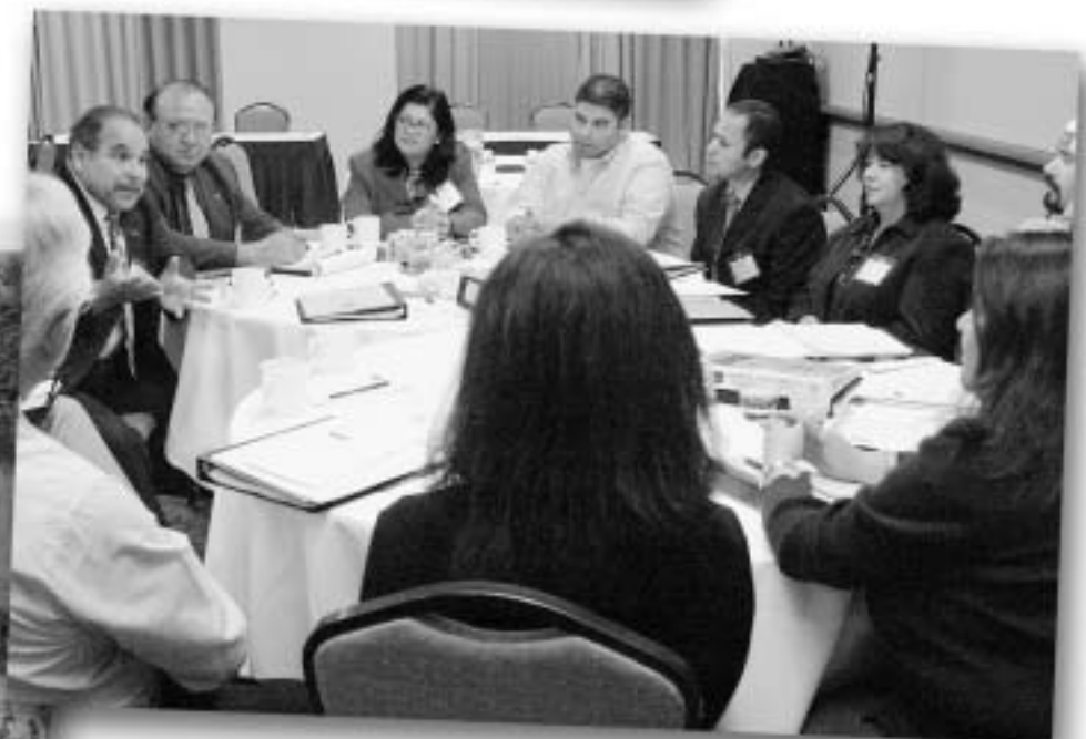
At the HACU Latino Higher Education Leadership Institute.