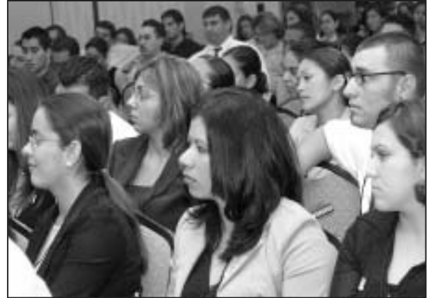
At the Student Track workshops.